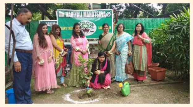
Members of OWA Dehradun organised a Tree Plantation Drive on August 15, 2019.