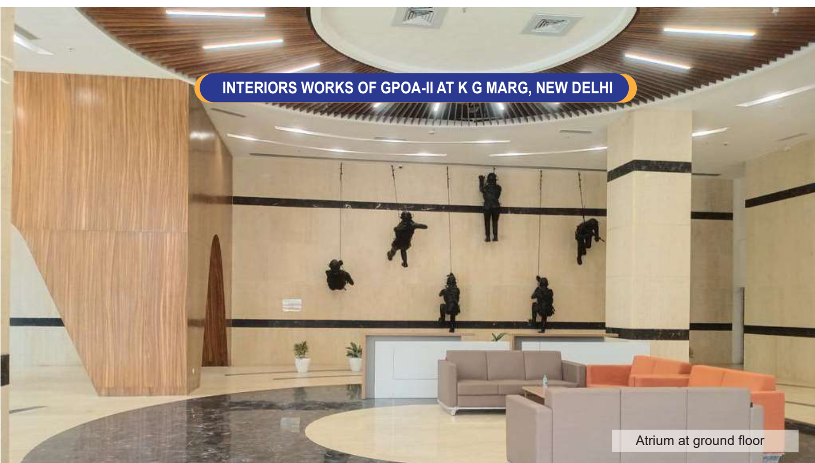
Atrium at ground floor