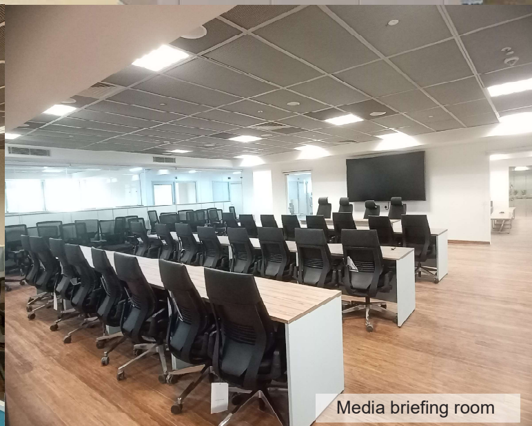
Media briefing room