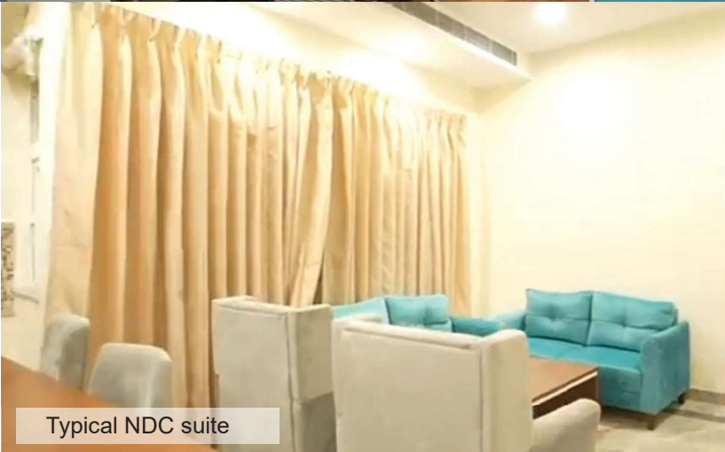
Typical NDC suite